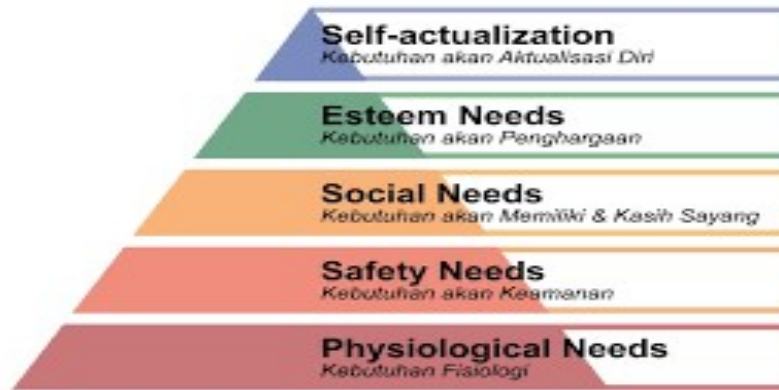
Figure 1: hierarchy of needs

Maslow calls his hierarchy of needs theory a synthetic or a combination of holistic and dynamic theories because Maslow based his theory following the functional tradition of James Dewey, which is combined with elements of weitheimer, goldstein, and gestalt psychology, as well as dynamism of freud, horney, reich, jung and adler, 34 to achieve the highest need, first the basic needs must be met, when these basic needs are satisfied, immediately other needs will emerge and dominate human behavior. 35