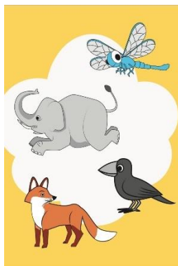
Figure 3. Back Cover of the Boardbook

Teacher and Student Responses Teacher responses indicated that the board book was engaging and easy to use, making learning more enjoyable and efficient for students. The teacher noted the board book's organized and systematic presentation, facilitating a better understanding of the material.