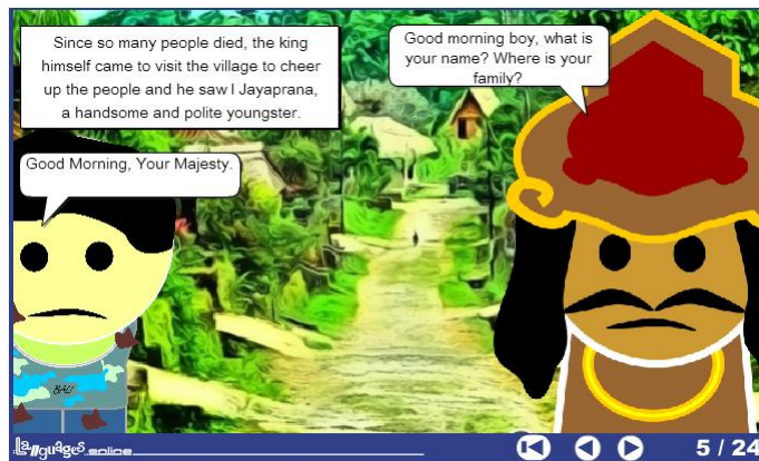
Figure 2: Converted story

The designing process was starting from converting the story into the episodes of the cartoon. In converting the story to cartoon, the sentences are changed into direct sentences to make the cartoon alive. For example in the text written “One day the king visited the village in order to cheer the survivors. He met I Jayaprana, a handsome and a polite boy”, when it is converted to the cartoon it is converted into some dialogues (Figure 4.11) to illustrate the meeting between Jayaprana and The King.