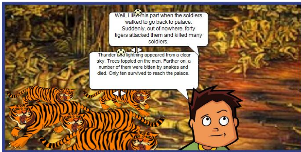
Figure 4: Episode before editing

The next input refers to the cut of episodes. Some panels consist of too many episodes or events of the story. The expert recommended that the researcher needs to separate the episodes into two or three panels. Figure 4.17 shows a picture with too many episodes and after being given input by the expert, the panel is changed and separated into two panels in Figure 4.18.