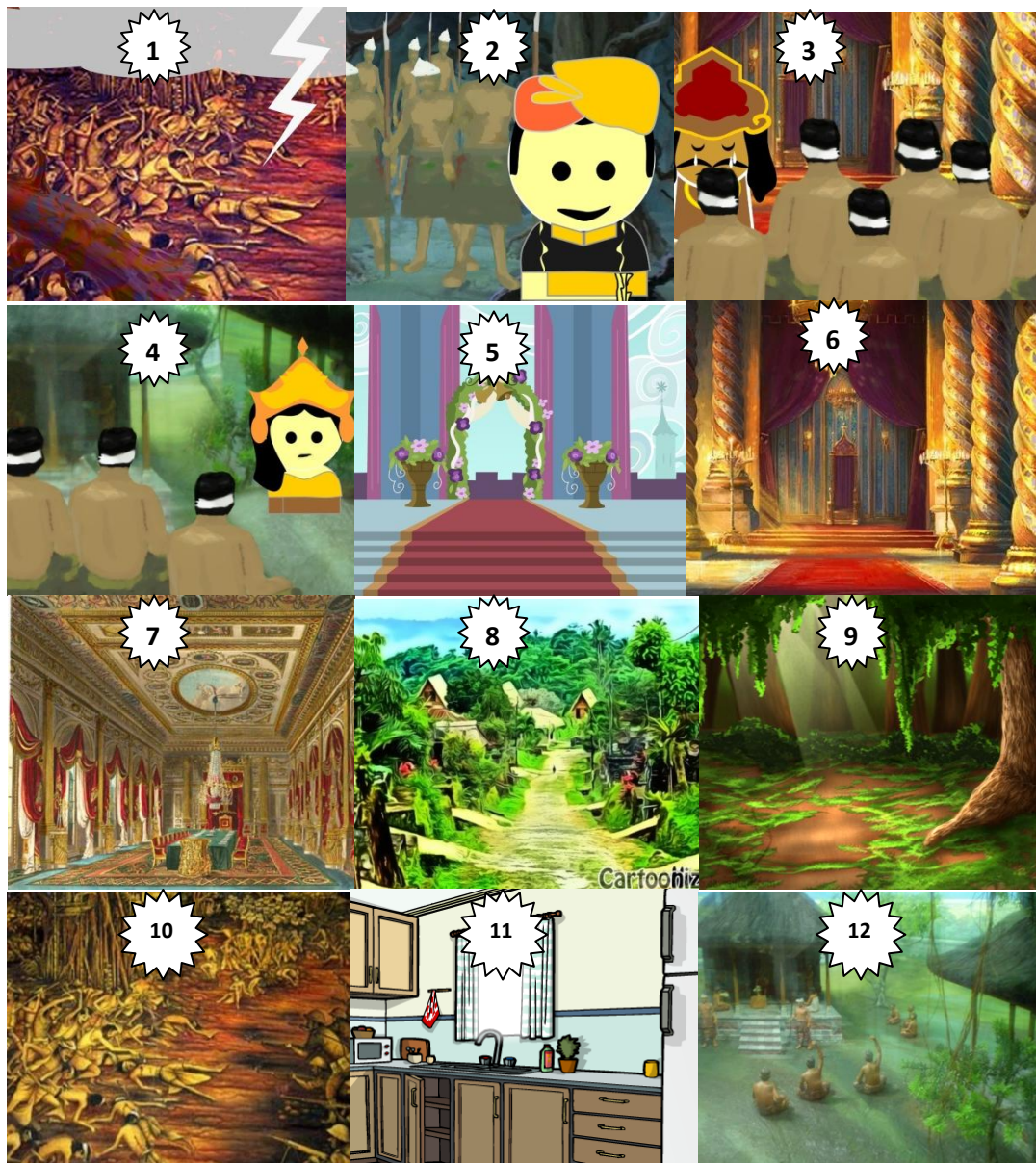
Figure 3: Backgrounds and foregrounds

The images are taken from various websites by the help of Google search engine. The keywords used are ‘Village cartoon’ for the image number 8, ‘Balinese cartoon’ for image number 12, ‘Wedding cartoon’ for number 5, ‘Palace cartoon’ for image number 6, ‘Forest cartoon’ for number 9, and ‘Colonize cartoon’ for number 10. The images chosen are manipulated by adding some effects or another image to present what is being told in the story. The example of manipulated image is image number 1 which is taken from image number 10. Besides background, the researcher also creates foreground along with the background such as in image number 2. The background of image