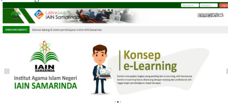
Figure 1. Web Display of E-learning IAIN Samarinda

Lecturing activities at this stage are carried out online by utilizing e-learning IAIN Samarinda at https://elearning.iain-samarinda.ac.id . The lecturer has instructed students to enter the LMS that has been provided for maximum use. E-learning Samarinda IAIN has been integrated into the Siakad system and e-journal lectures so that the database has been made as a student who will later be seen in the system e-learning what courses are followed and also the name of the lecturer has been seen in the tools. Previous lecturer has made teaching materials and included some teaching materials and instructions in https://elearning.iain-samarinda.ac.id :