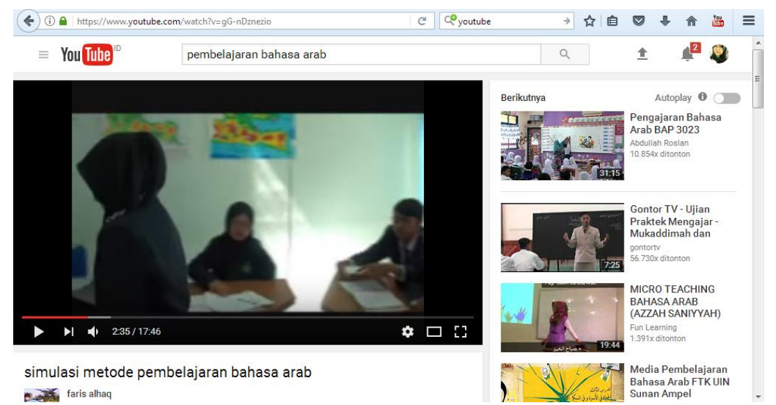
Figure 1. Example of Arabic language teaching methods on YouTube

YouTube-based learning methods can be done educators with varied learning models so that learning is more pleased, interested to learn so that the learning process becomes meaningful learning. By applying YouTube-based learning, students will be accustomed to thinking critically and encouraging students to become independent students (June, Yaacob, & Kheng, 2014). Students will also be accustomed to seeking information from various sources to learn. Moreover, Ebied et.al (2016) explain that another thing that is not less important is that with YouTube-based learning knowledge and student insight develops, can improve learning outcomes, thus the implications for the quality of education will also increase. The example of Arabic language teaching methods can also easily accessed from the YouTube itself, as the example below.