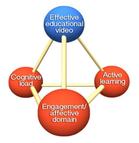
Figure 2. Components of Effective Educational Videos (Brame, 2015)

The abundant number of videos available in YouTube requires the teachers to carefully select. According to In order for video to serve as a productive part of a learning experience, however, it is important for the instructor to consider three elements for video design and implementation, namely cognitive load, non-cognitive elements that impact engagement and features that promote active learning.