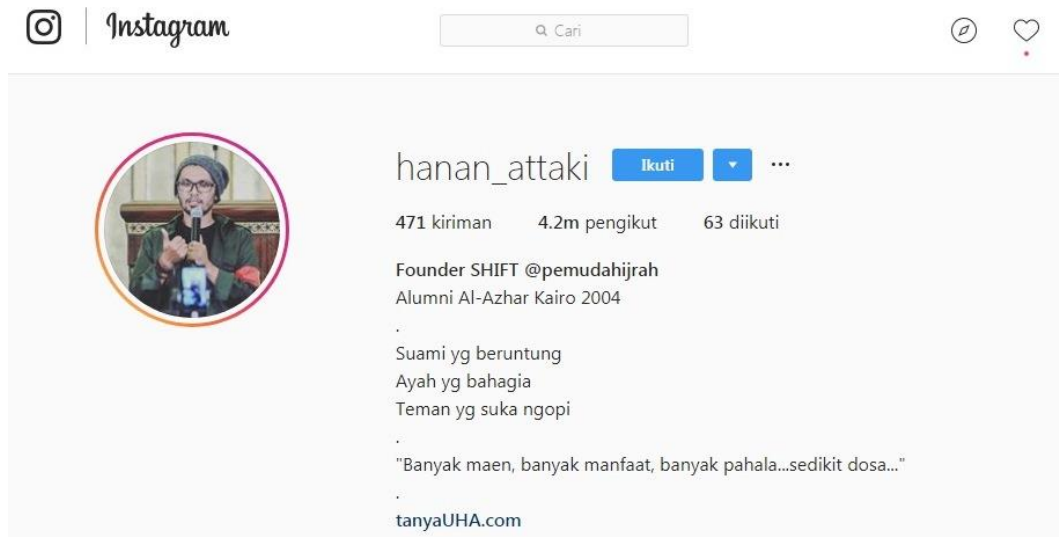
Picture 2 Instagram account of Hanan Attaki

Report from Tempo Magazine, 18-24 June 2018 edition, highlight the Da'wa of Hannan Attaki. With his team, Hannan Attaki tries to maximize the use of social media, especially Instagram. According to the report, Instagram is popular among those who are under 30. Hanan gets helps from six people from Gerakan Pemuda Hijrah (Pemuda Hijrah Movement) to organize social media for Da'wa. One of many social media contents that characterize Hannan Attaki's work is One Minute Booster. This type of content contains Hannan Attaki's most famous recorded preaching in short and cut form. Pemuda Hijrah Movement also produced videos with skateboard and motorist communities to signify their inclusive tendency of doing Da'wa. 26