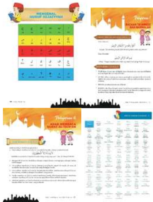
1.4 Picture Materi Realization of Material Pages

Module Feasibility and Module Validation Results Module feasibility testing is validated by two experts, namely material experts and learning media experts. Material expert validation by Drs. Ahmad Al Badawi, M. Pd., He is the